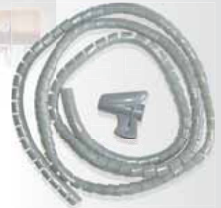
CT-2M CABLE TIDY