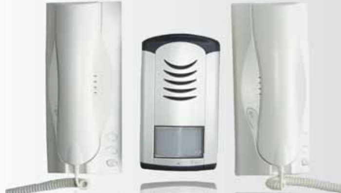
1129502 URMET INTERCOM - TWO FAMILY KIT