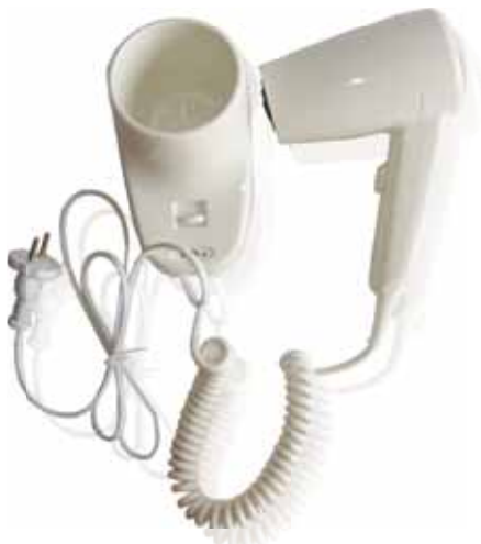
5406STA WALL MOUNTED HAIR DRYER 1250W