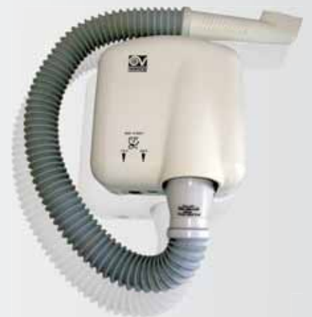
70901 VORTICE HAIR DRYER WITH FLEXIBLE HOSE AND RAZOR SOCKET 900W