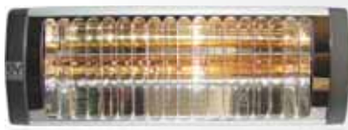
70065 VORTICE THERMOLOGIKA SOLEIL PLUS SUITABLE FOR INDOOR/OUTDOOR HEATING