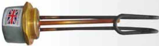
314ANT ANTI-CORROSIVE IMMERSION HEATER