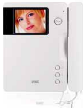
1783-622 SIGNO - URMET TWO FAMILY VIDEO KIT