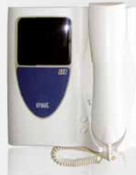
952-51 SMILE - URMET VIDEO KIT