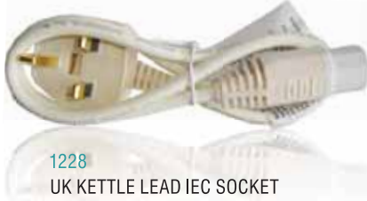
1228 UK KETTLE LEAD IEC SOCKET