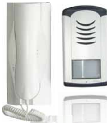
1129501 URMET INTERCOM - ONE FAMILY KIT