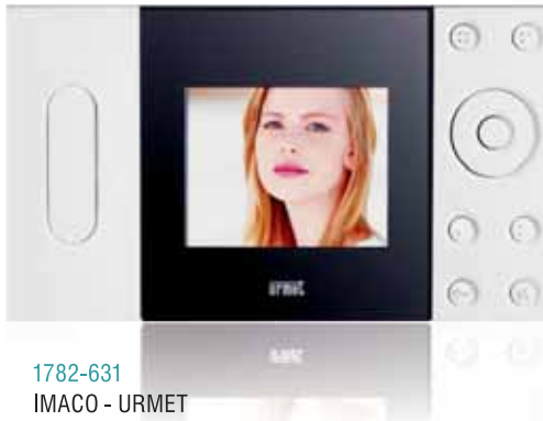
1782-631 IMAGO - URMET DIGITAL VIDEO KIT