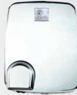
19230 VORTICE METAL HAND DRYER VANDAL-PROOF - SILVER COLOUR 1950W