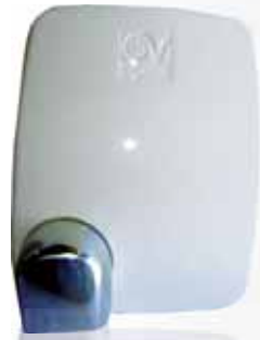
19220 VORTICEMETAL HAND DRYER VANDAL- PROOF - WHITE COLOUR 1950W