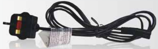
1219 POWER SUPPLY CORDS