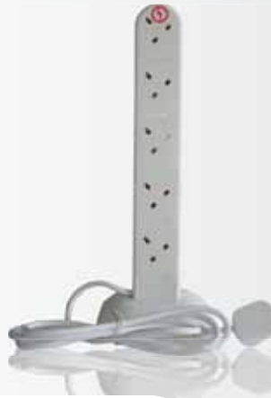
9493 10 GANG - 2 METERS LEAD