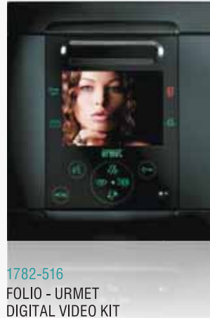
1782-516 FOLIO - URMET DIGITAL VIDEO KIT