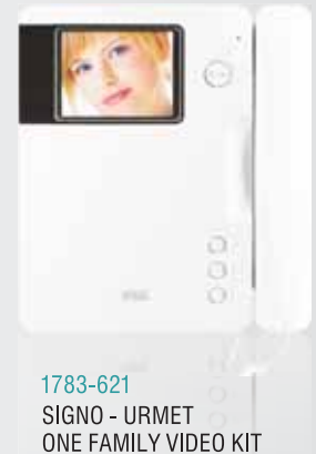
1783-621 SIGNO - URMET ONE FAMILY VIDEO KIT