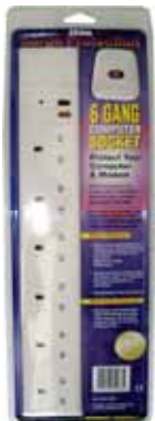
9463 6 GANG - 2 METERS LEAD