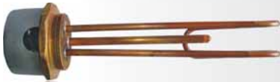
314 COPPER IMMERSION HEATER