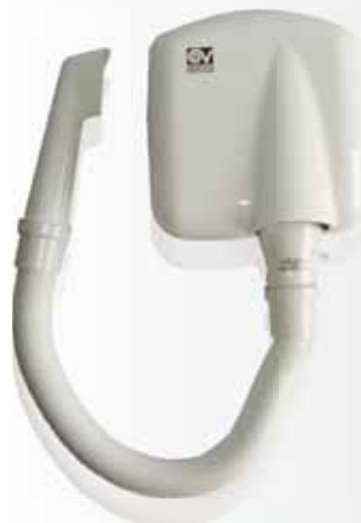
70900 VORTICE HAIR DRYER WITH FLEXIBLE HOSE WITH RAZOR SOCKET 900W