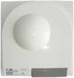
19330 VORTICE HAND DRYER ECO DRY